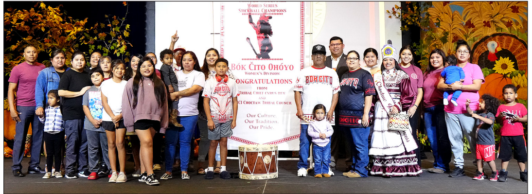
2024 Women's Division Champion - Bok Cito Ohoyo