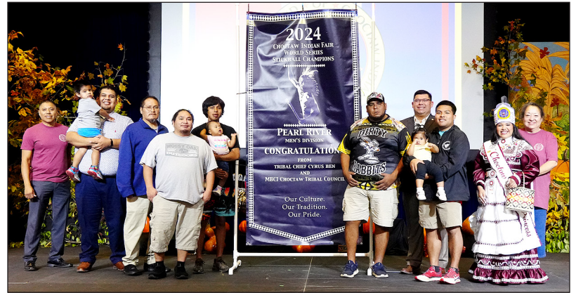
2024 Men's Division Champion - Pearl River