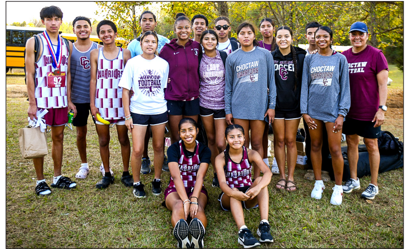
Pictured are members of Choctaw Central's cross country teams.