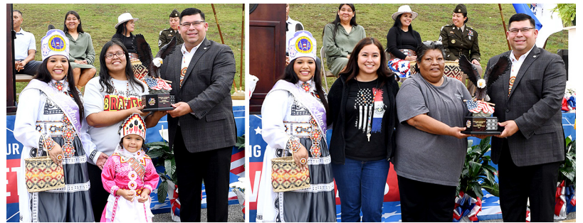
RIGHT , from left to right are representatives for float category winners Red Water Elementary School & vehicle category winners Choctaw Transit.