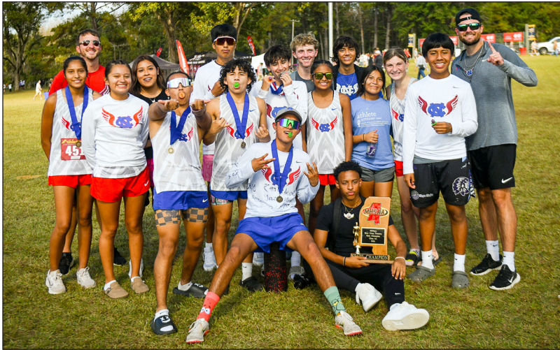
Pictured are several members of Neshoba Central's cross country teams celebrating with the Class 6A boys state championship.