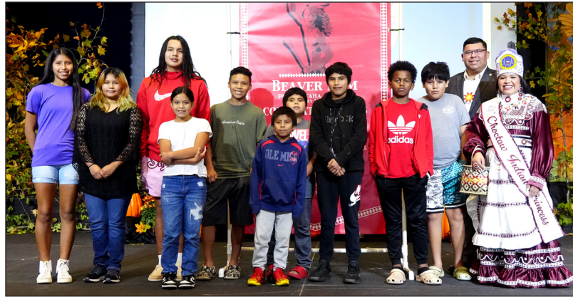
2024 Pushmataha Division Champion - Beaver Dam