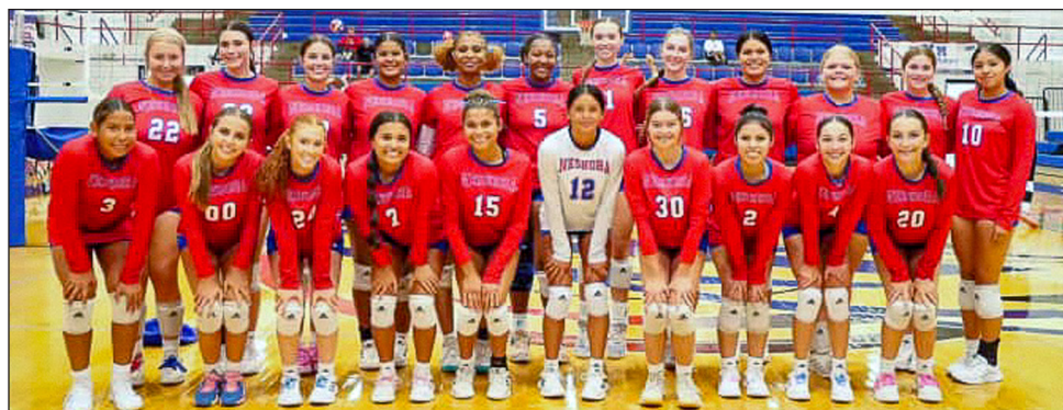
Neshoba Central Lady Rockets Volleyball Team