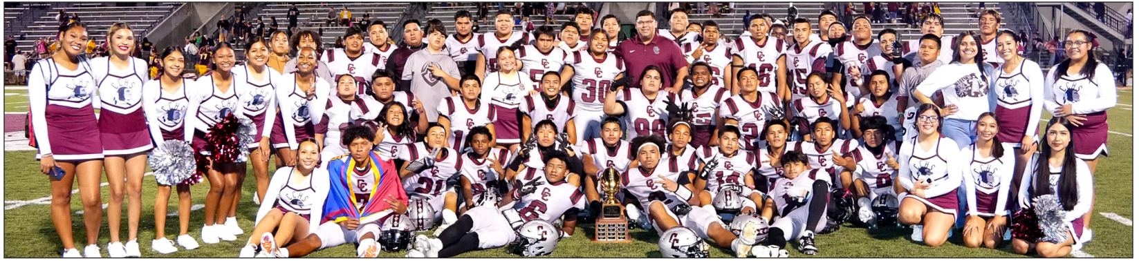
Choctaw Central Warriors Football Team & Cheerleaders