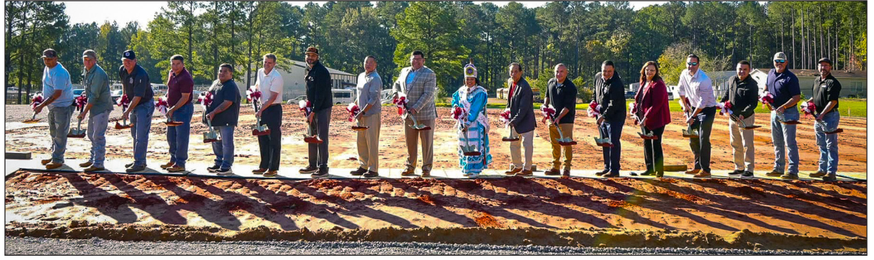
Ground was broken for a new Broadband Building to be constructed near the Office of Construction Management in the Pearl River community. The building is expected to be completed in Fall 2025.

I was honored to host the Henning Community Thanksgiving Feast on November 2 and the Tribal-Wide Thanksgiving Feast on November 5. It was a joy to witness our Tribal members coming together to share a meal and fellowship together. Thank you to the Pearl River Resort staff for preparing and helping to serve the dinner, and thank you to all the organizers and the many volunteers who came together to make these two feasts a great success.