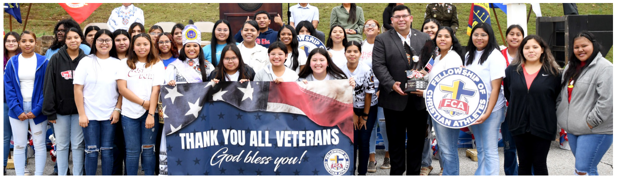
Pictured above are parade walking category winners Choctaw Central High School Fellowship of Christian Athletes.