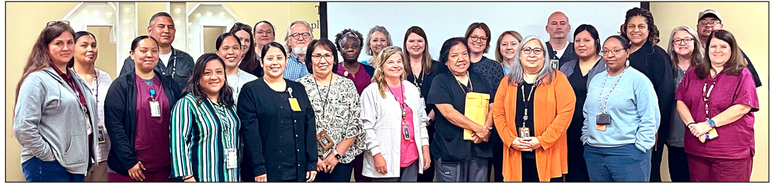
Pictured above are members of CHC's Quality Management Team.