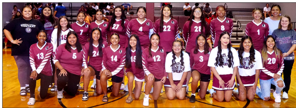
Choctaw Central Lady Warriors Volleyball Team